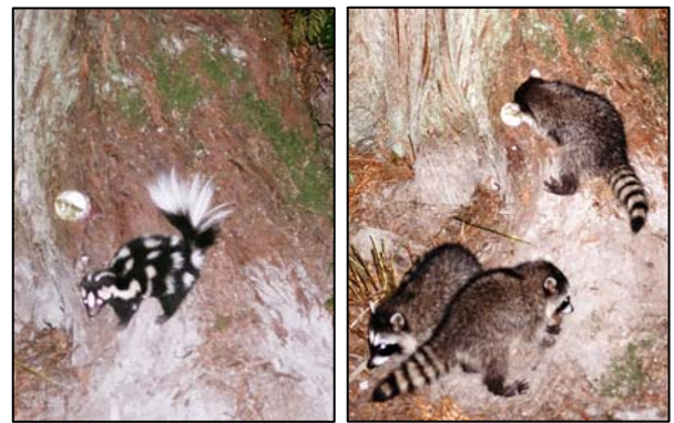
Spotted Skunk ( Spilogale gracilis ) and Raccoon ( Procyon lotor ) attracted to bait and photographed.

River otters are one of the larger members of the weasel family and spend the majority of their time in water. Since fish are the primary source of food for this carnivore, the research team hypothesizes that the return of salmon may directly affect their future patterns of distribution and abundance. Although otters spend much of their time in rivers, they frequently come on land to use latrine sites (just what it sounds like). Latrines are sites used for scent marking that allow for communication between otters. These special sites are characterized by otter sign such as trails, steep 'slides' into the water, soil disturbance, and piles of leaves or other debris gathered into small 'scent mounds.' The research team is searching for and mapping latrine sites, collecting hair samples from otters using hair grabbing devices that do not harm the animals, and collecting otter scats.