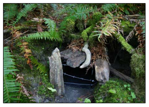
Entrance to a track box where an animal will enter for cat food and leave behind tracks. See tracks on next page.

The first step in conducting a large-scale wildlife survey is to develop a repeatable survey design. Since it is not feasible for the research team to survey wildlife populations throughout all of the riparian zones in the Elwha River system, the team is focusing their survey efforts on river segments representative of both the Elwha main channel and side-channels from the river's mouth to river mile thirtyfive above both dams. Through this approach, approximately one third of the whole river will be studied, which is predicted to receive the most significant changes in the watershed. The research team will repeatedly survey the selected river segments to determine the proportion of sites occupied or used by targeted riparian wildlife populations. The Wildlife Research Team is using different survey methods to study different groups of wildlife, which are outlined below.