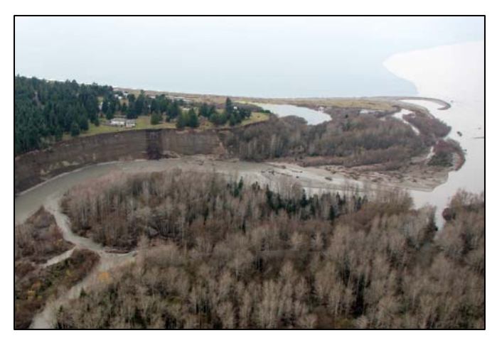
The riparian zone at the mouth of the Elwha River during the Winter 2007 flood.

The diversity of vegetation, foods, and structures (logs, large trees, pools, river banks) found in the riparian zone creates important habitat for a great variety of wildlife species. Habitat is a home for wildlife that meets needs for water, food, shelter,