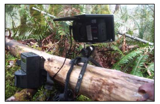
This motion sensing camera automatically takes a photograph when an animal passes in front of it.

questions. For example, what are the current distributions of a variety of wildlife species in the Elwha River? What environmental factors are associated with wildlife distributions? What is the abundance of amphibian pools in the floodplain?